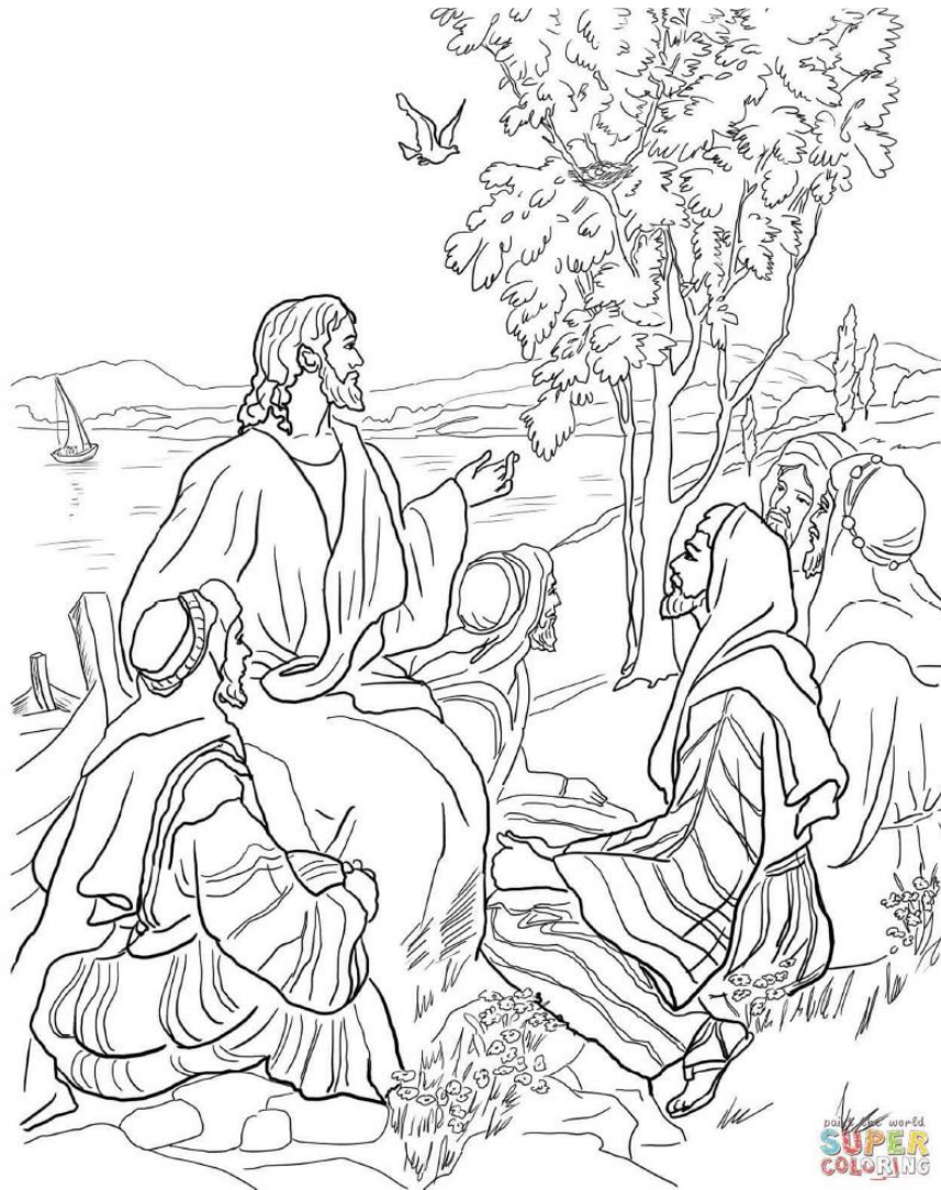
The Parable of the Mustard Seed and the Yeast Matthew 13:31-33

Each number represents a letter of the alphabet. Substitute the correct letter for the numbers to reveal the coded words.