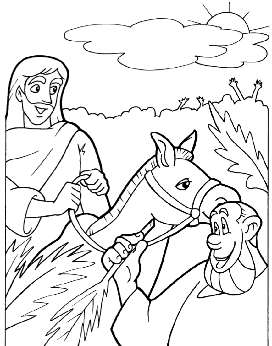
The Triumphal Entry